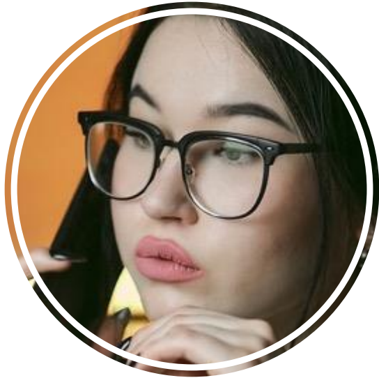
Direct Verbal Clues