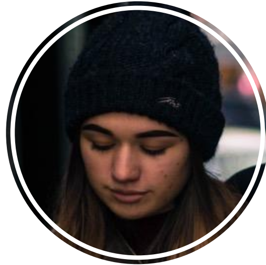
Indirect Verbal Clues