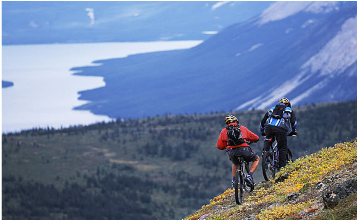
Exploring Silver Rush Trails on Montana Mountain, near Carcross, Yukon Territory